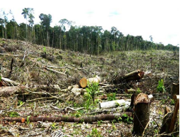
Deforestación en la Localidad de Tamshiyacu, Loreto.